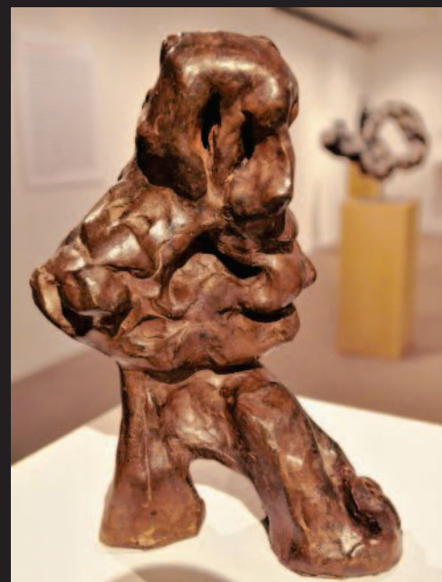
Art Maker | Page 5