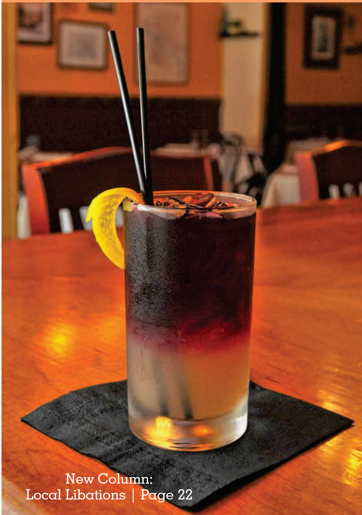
New Column: Local Libations | Page 22