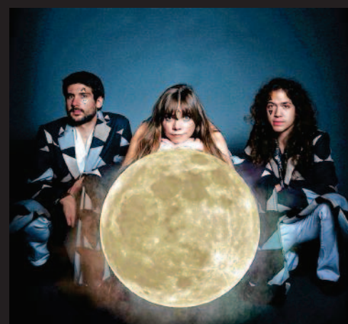
Tuned In | Page 4